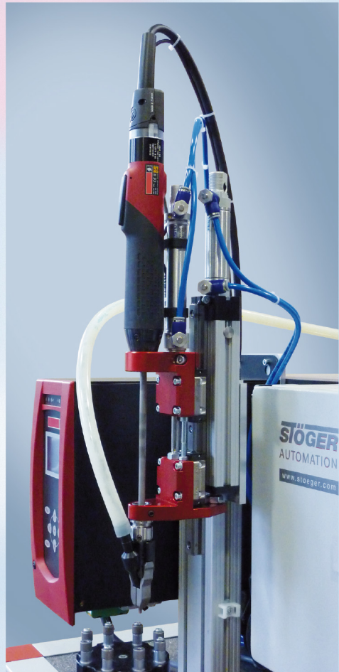
SEL with electric motor