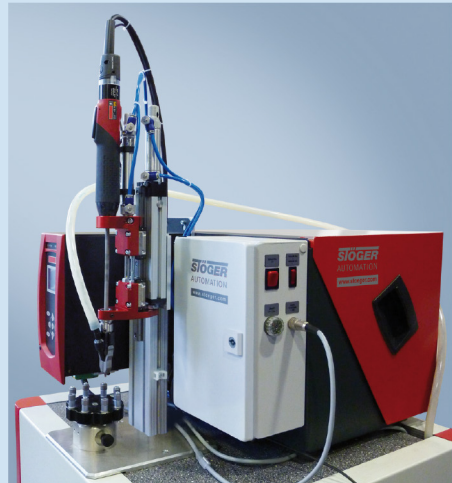
SEL with feed and control unit ZSE