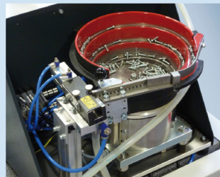
Feed and control unit ZSE